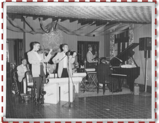
Photos taken from AXP Formals in the 1950s