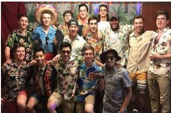
The New Initiates

Pledgeship has been an eye-opening journey for our pledge class. When I ran for Pledge Class President, I ran because I wanted pledgeship to go as smoothly as possible. I have learned how to lead a group of individuals who come from different parts of the country and have vastly different backgrounds. Pledgeship has created many lifelong friendships for all of us. We have grown closer to one another in ten weeks than I ever would have imagined. I cannot wait to see what the future holds for our class and the fraternity of Alpha Chi Rho.