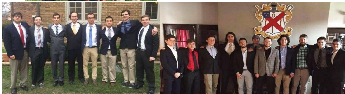
Post-initiation group pictures of various "Pledge families" within the Phi Kappa Chapter