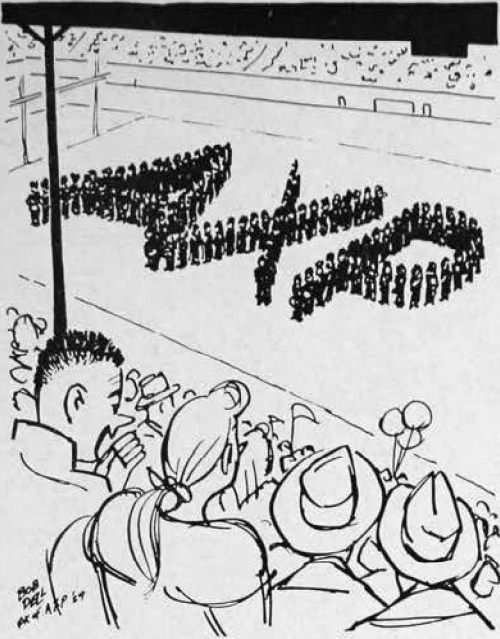
"We eased up on football players and concentrated on pledging musicians."