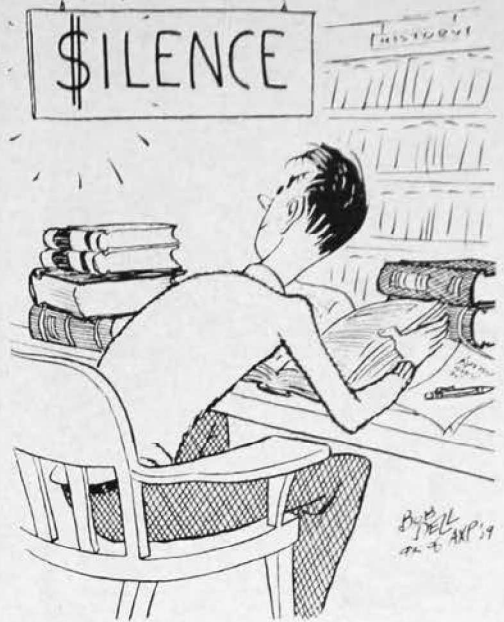
"The men who make the A's but seldom engage in campus activities outside the library make the most money."